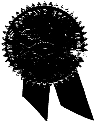
Lamar Fisher Mayor

IN WITNESS WHEREOF , I urge residents to participate in the parade by decorating their vessels, residences and seawalls along the parade route, and joining the well wishers along the Intracoastal Waterway, Given under my signature and the seal of the City of Pompano Beach this 10 th day of November, 2009.