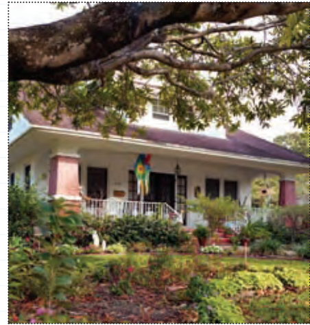
Above: Historic registered Austin House located at 410 NE 5 th Avenue, Pompano Beach

In general, properties should be at least 50 years old. Inclusion on the City's Historic Register in some cases qualifies properties for state or