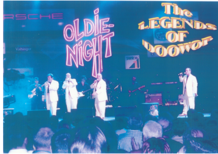
Legends of Doo Wop